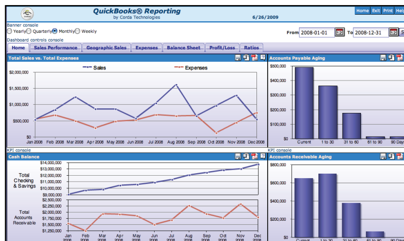
Figure 1. With a CenterView performance dashboard you can view CRM data stored at Salesforce.com alongside other valuable company data

Companies that use Salesforce.com find it invaluable for storing their CRM data, and while Salesforce.com allows you to store other types of data in its database, many companies use methods outside of Salesforce.com to store data that is not CRM related. For example, accounting data might be stored in a Microsoft® Excel® spreadsheet. By using CenterView in conjunction with Salesforce.com, you can pull data from diverse sources and view it in one performance dashboard. This functionality makes it easy to view data stored in Salesforce.com, such as sales projections, alongside financial data like accounts receivable. CenterView can pull data from virtually any source to let you compare metrics side-by-side and ensure that you can access the information you need to make key decisions, and that you can access it when you need it.